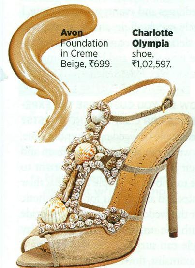
Avon Foundation in Creme Beige, ₹699.