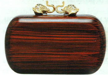
Tory Burch clutch, ₹25,890.