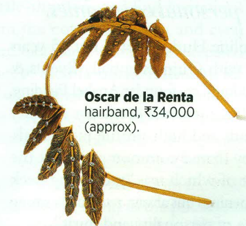
Oscar de la Renta hairband, ₹34,000 (approx).

"Natural textures and colours are a growing trend in bridal style, which give an organic feeling to the event."